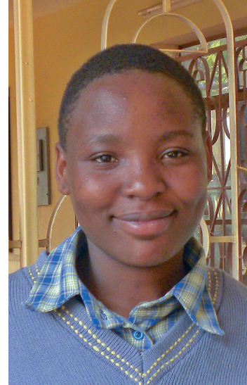
T H E S T A R T VERO