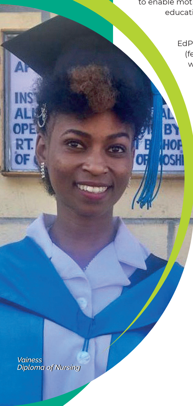
Vainess Diploma of Nursing