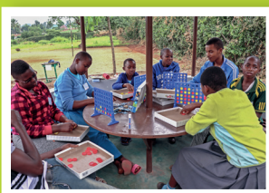
STUDENT HUTS Learning can include games!