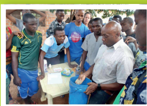
THE GIRLS AND BOYS CLUB Sharing how to run a poultry business