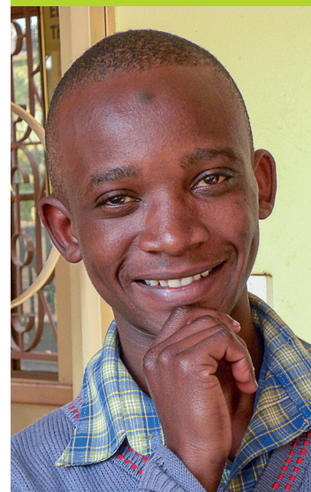
T H E S T A R T ALLY