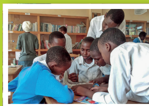
THE LIBRARY Serving students and the community