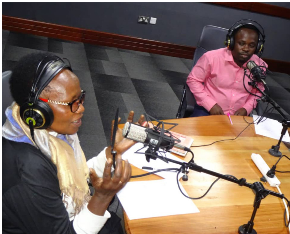
Mama Grace advocating for those with special needs during a media campaign.

While promoting vocational and inclusive learning, CAT reached a wider audience through media campaigns and topical seminars of importance to all stakeholders, including one on raising awareness of sexual abuse of youth with disabilities. At the same time, the CAT staff, funded by EdPowerment, continued to supervise the Youth Center (for vocational work) that it operates with other partners.