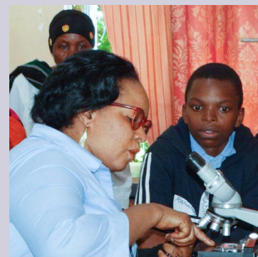
Students demonstrate equipment to their parents.