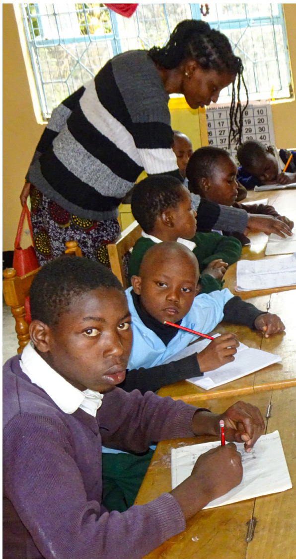
CAT focused on promoting inclusive schoolrooms in 2020