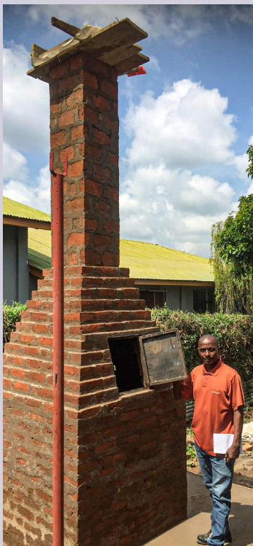
New incinerator ensures cleaner sanitation.

This is EdPowerment's mission: bringing EDUCATIONAL OPPORTUNITY to all.