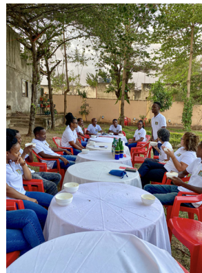
Our sponsored students planned a great 10-year celebration during our management visit in October.