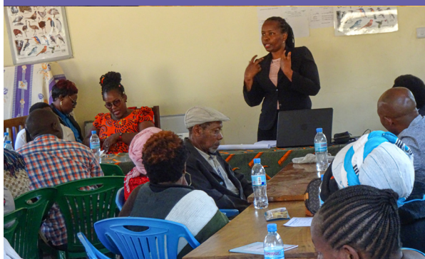
Seminars deliver critical information – this one centered on awareness of sexual abuse