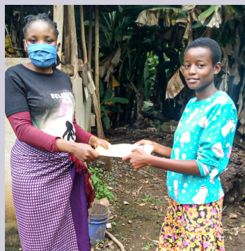
Teachers bringing work to students at their homes.