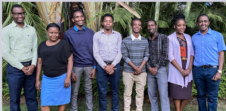
Talented teachers at our 10-year dinner celebration for them.