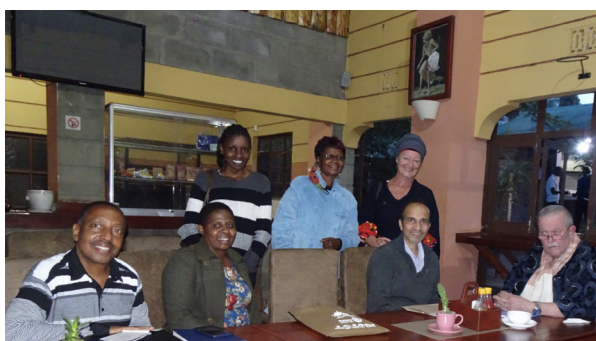
Connects Autism Tanzania's Educational Presentation to Rotarians