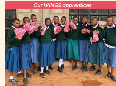
Our WINGS apprentices