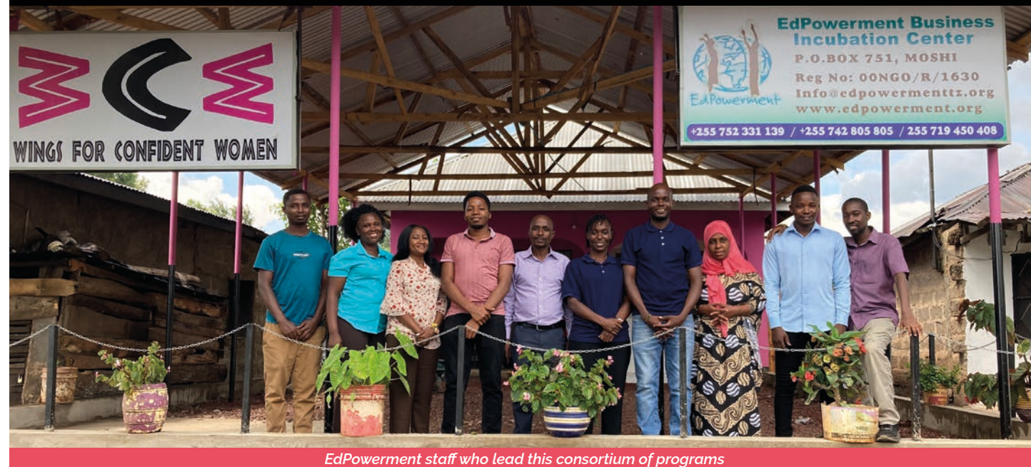
EdPowerment staff who lead this consortium of programs

An outgrowth of the Boys and Girls Club at the government Dahani Secondary School, the Center is a major step forward in serving young adults who are not able to pursue higher education.