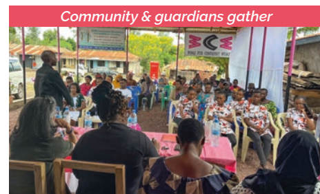
Community & guardians gather

Initially, 4 apprentices have been selected for each category through a process coordinated with Dahani and local ward offices. These apprentices are being instructed in the specific skills of their area, fundamental English, and business basics for a period of 6 months to a year. Once they have successfully completed the program, each will be given an initial package of tools or materials with which they can begin their own entrepreneurship efforts. The Center will provide an ongoing production space for them as scheduling permits. Take a look at Opening Day: