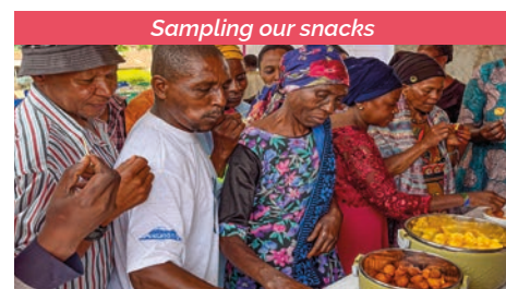
Sampling our snacks