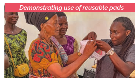
Demonstrating use of reusable pads