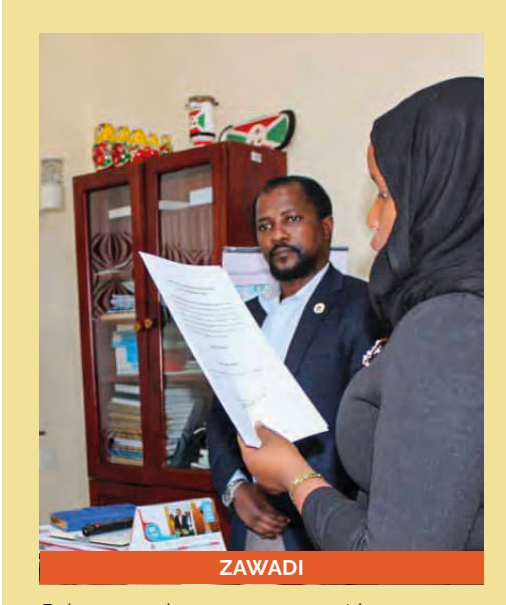
Being sworn in as a government lawyer, Tanzania Human Rights & Good Governance Committee, Mtwara.