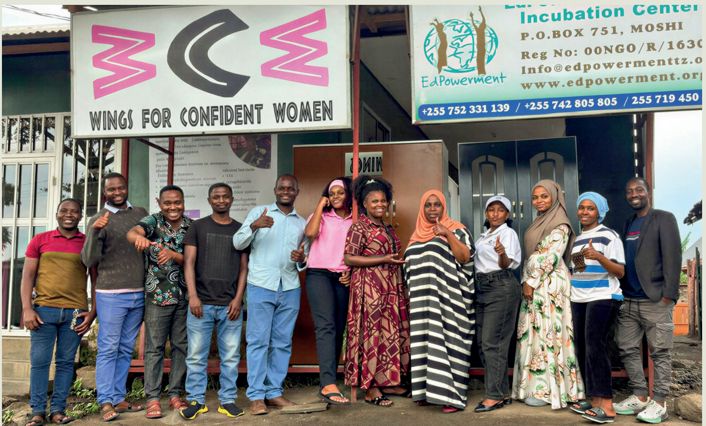
CENTER'S DEDICATED STAFF

From day one, apprentices learn what most schools never teach: how to find customers, manage money, think creatively, and use the internet to grow. All apprentices and interns learn critical ICT skills – and the Center's ICT program extends to ALL area students, teachers and community members, offering Digital Skills Training and services otherwise unavailable.